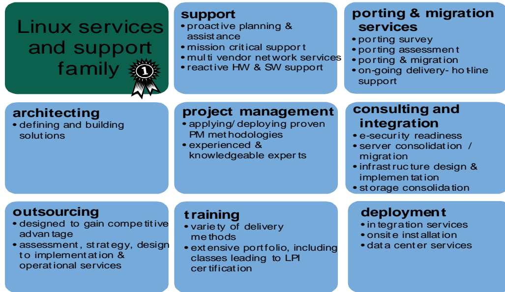
figure 3 – lifecycle services for Linux and the Itanium platform available from hp